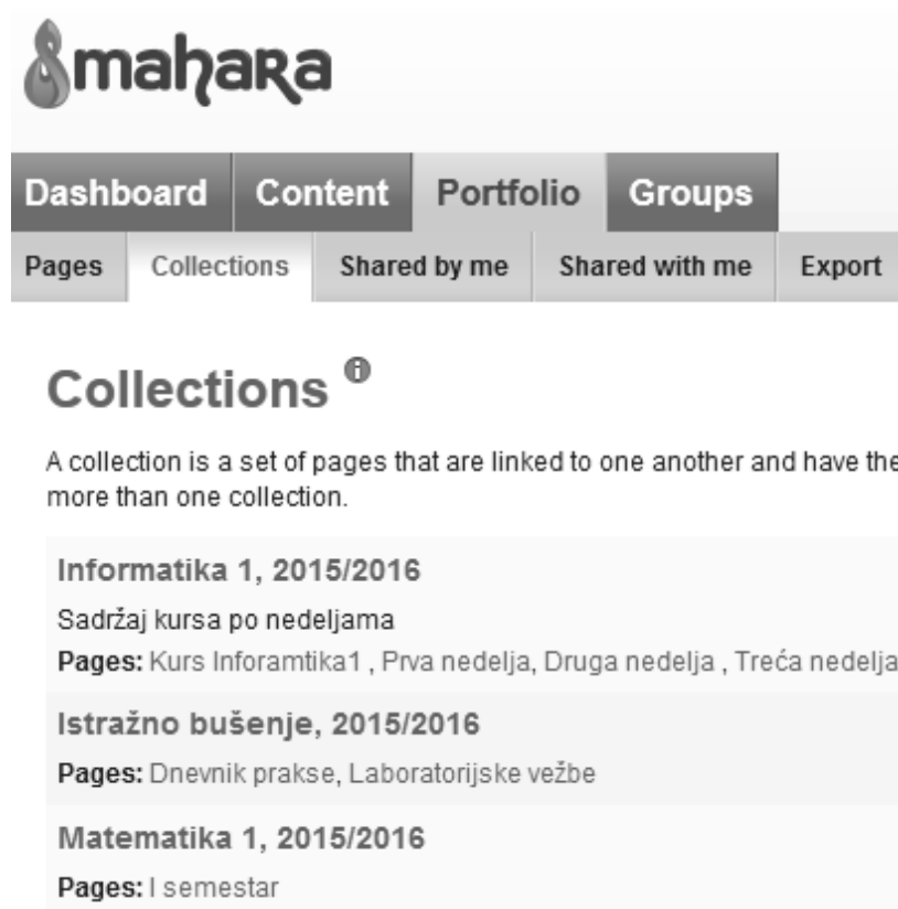
Figure 2: Lists of collections in Mahara

(Figure 2). Finally, the platform offers a range of possibilities for portfolio sharing and allows forming of discussion groups, as well as their own accounts and profiles. The interface is largely applicable and is suitable for implementation for users with different levels of computer skills [12].